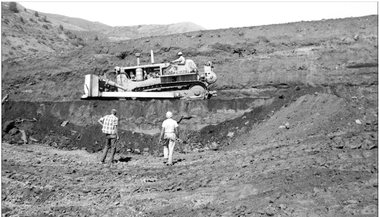
Figure 130. Mining ore, Diamond Gulch Mine, May, 1960.