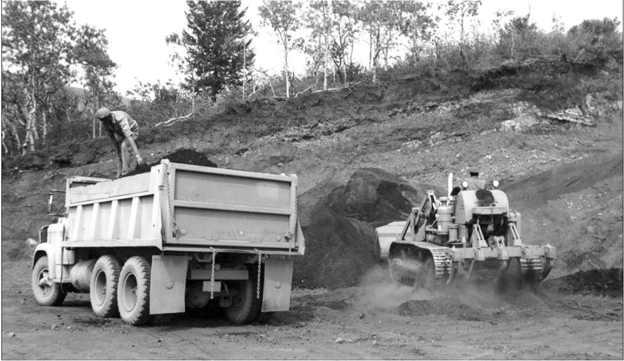
Figure 132. Loading ore, Diamond Gulch Mine, May, 1960.