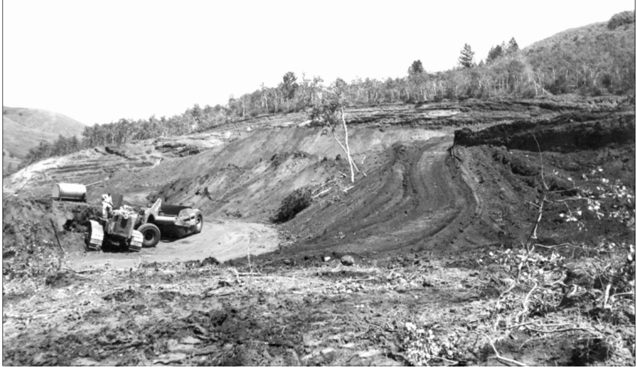
Figure 129. Stripping overburden, Diamond Gulch Mine, May, 1960. BLM file photo.