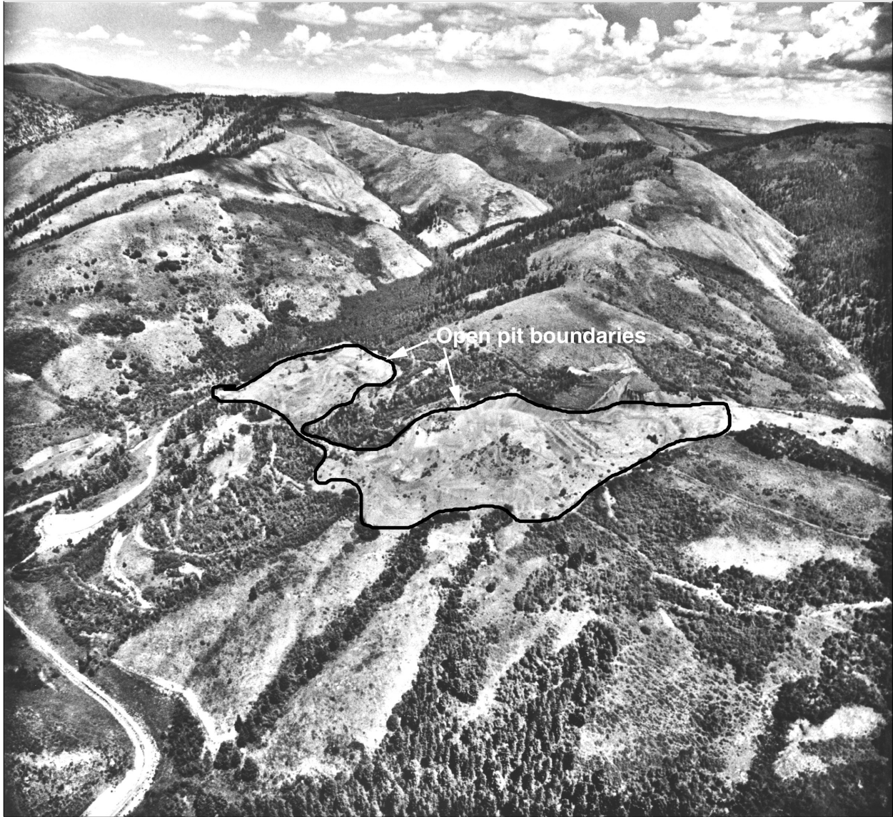
Figure 131. Diamond Gulch Mine, 1975, view east, showing open pit boundaries.

bodies. Only the high-grade phosphate ore was sold and the lower-grade phosphatic shales were stockpiled on the lease and at the company's processing facility. Since the SFCC had no facilities to upgrade the phosphatic shales, an effort was made to sell the shales to either the Monsanto Company or the Central Farmers Fertilizer Company as feedstock for electro-processing into elemental phosphorous. Monsanto even engaged in a small drilling and analysis program on the lease but decided that they did not need the ore for their processing. Because of the failure to sell the lower grade shales and other economic and geologic considerations, the mine was closed prior to the 1961 mining season. Reclamation was conducted on the mine site during 1961 and 1962 (Figure 133).