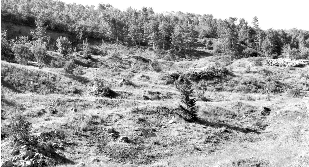
Figure 133. Diamond Gulch Mine, June 26, 1996.